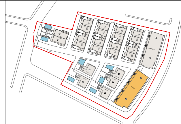
PLANI I VENDOSJES SE APARTAMENTEVE SH 1: 750